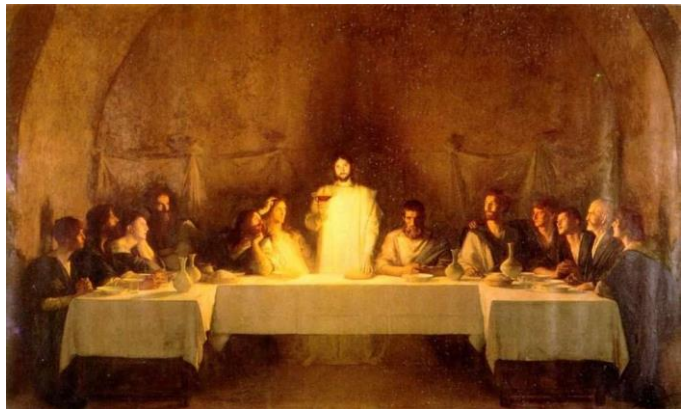
The Last Supper by Pascal Dagnan-Bouveret, 1896

Jesus, Body and Blood, We are grateful for the gift Of your life And the way it strengthens us To live ours. Teach us to draw on the gift Of your Body and Blood for Energy, Renewal, Strength, and Grace. May we never take the gift Of your presence for granted. Amen.