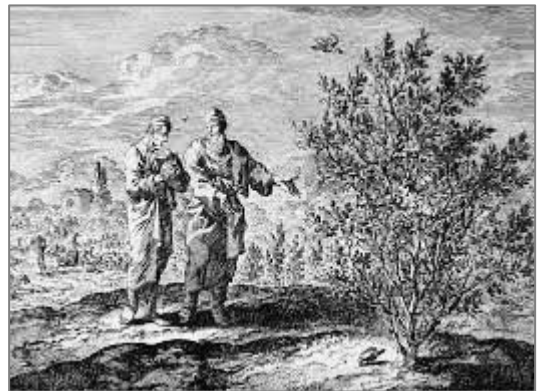
The Parable of the Mustard Seed by Jan Luyken, Wikimedia Commons