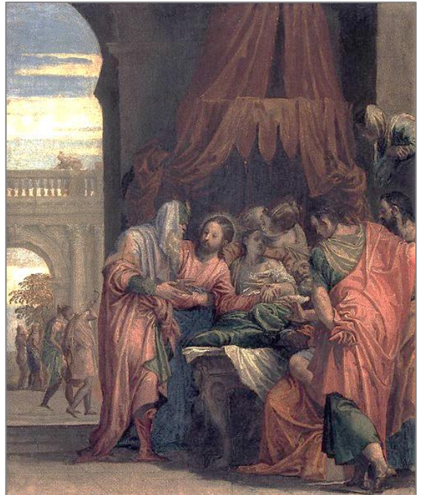
Raising of the Daughter of Jairus, by Paolo Veronese, c. 1540s

Through Jesus Christ in union with the Holy Spirit, one God forever, amen. Amen.