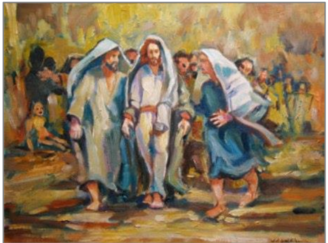
Jesus Rejected in Nazareth

Lord, I pray that I may recognize your presence in the ordinary encounters of my day and notice the ways through which You desire to nourish me and give me life, because You are present in all things.