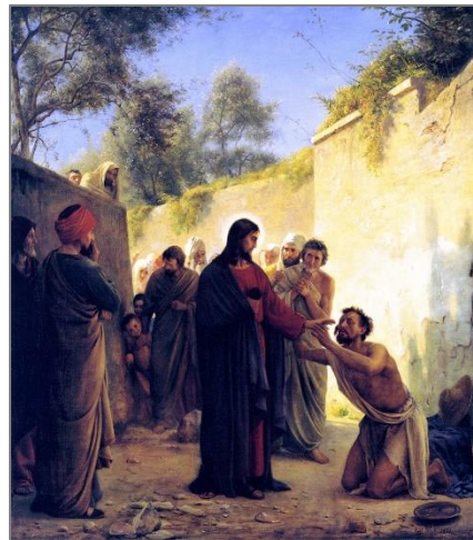
Healing of the Blind Man, by Carl Bloch, c. 1871

for your sake and the sake of the gospel. We ask this in Christ's name, Amen.