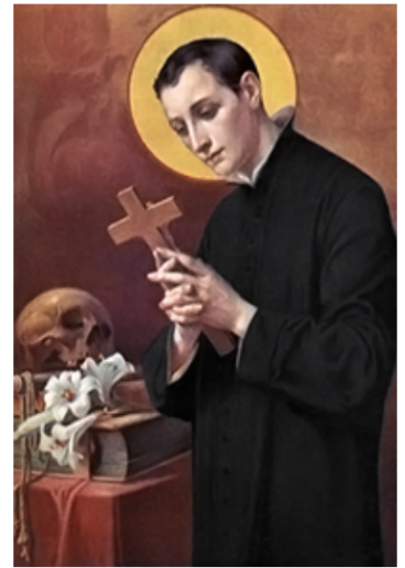
MARCH 9, 1568 – JUNE 21, 1591

We, as a Christian Community, inspired by the Holy Spirit, strive to live our Baptismal Promises by using our time, talent and treasure to reach out to others as Jesus did.