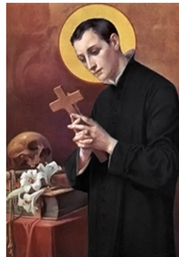
MARCH 9, 1568 – JUNE 21, 1591

Promises by using our time, talent and treasure to reach out to others as Jesus did.