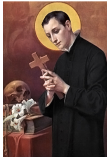
MARCH 9, 1568 – JUNE 21, 1591

We, as a Christian Community, inspired by the Holy Spirit, strive to live our Baptismal Promises by using our time, talent and treasure to reach out to others as Jesus did .