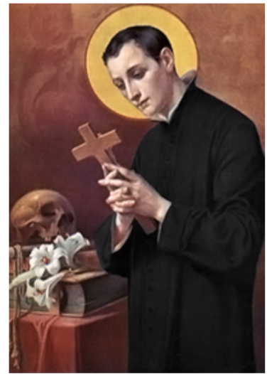
MARCH 9, 1568 – JUNE 21, 1591

We, as a Christian Community, inspired by the Holy Spirit, strive to live our Baptismal Promises by using our time, talent and treasure to reach out to others as Jesus did .