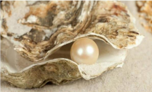
THE PEARL IS THE OYSTER'S RESPONSE TO PAIN