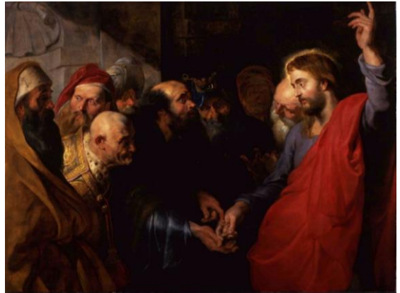
Caesar's Coin , by Peter Paul Rubens