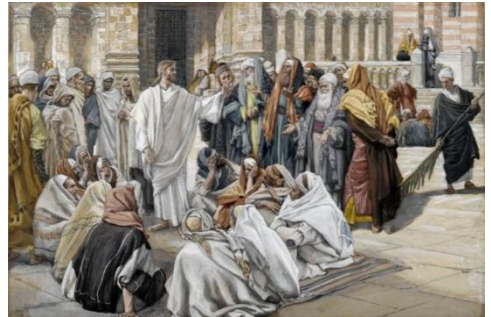
The Pharisees Question Jesus, by James Tissot