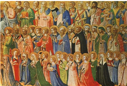
Painting of various saints by Fra Angelico

Lord, as the saints in Heaven adore You for eternity, I pray for their intercession. Saints of God, please come to my aide. Pray for me and bring to me the grace I need to live a holy life in imitation of your own lives. All saints of God, pray for us. Jesus, I trust in You.