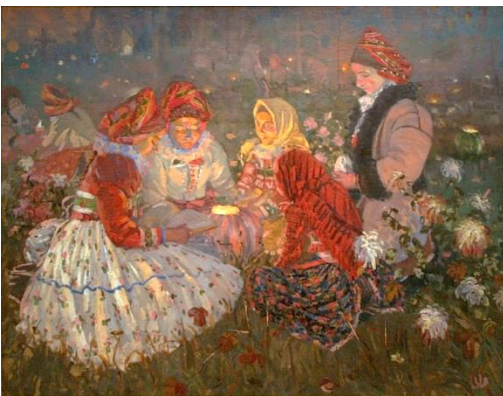
All Souls' Day by Joza Uprka

Merciful Father, hear our prayer and console us. As we renew our faith in Your Son, whom You raised from the dead, strengthen our hope that all our departed brothers and sisters will share in His resurrection, who lives and reigns with You and the Holy Spirit, one God, for ever and ever. Amen.